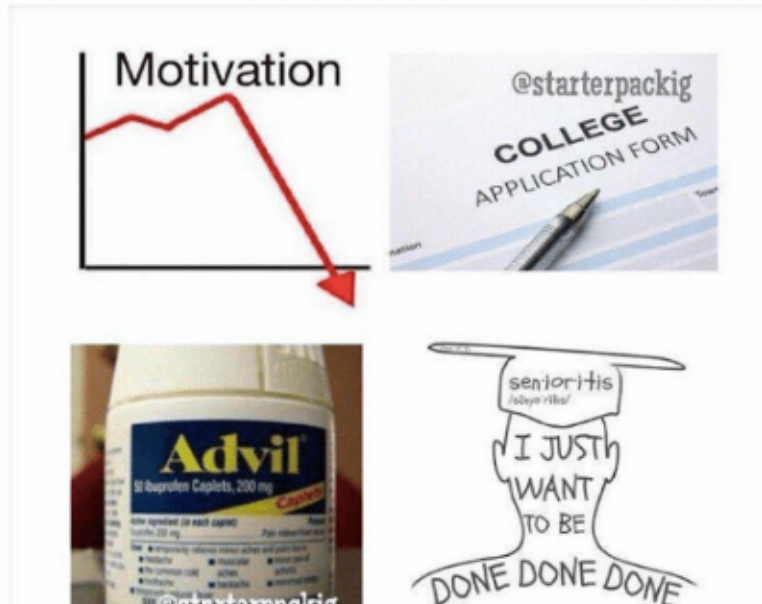
The "Senior year" Starter pack