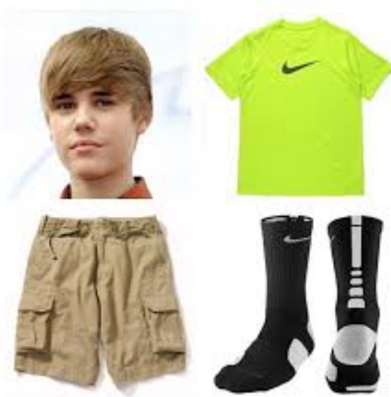
Freshman Boy Starter Pack