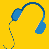
3.5 aux Cable Headphones