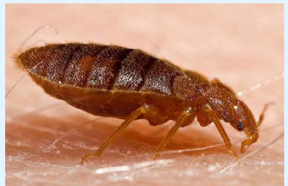
Bed bug images provided by U.S. Centers for Disease Control and Prevention